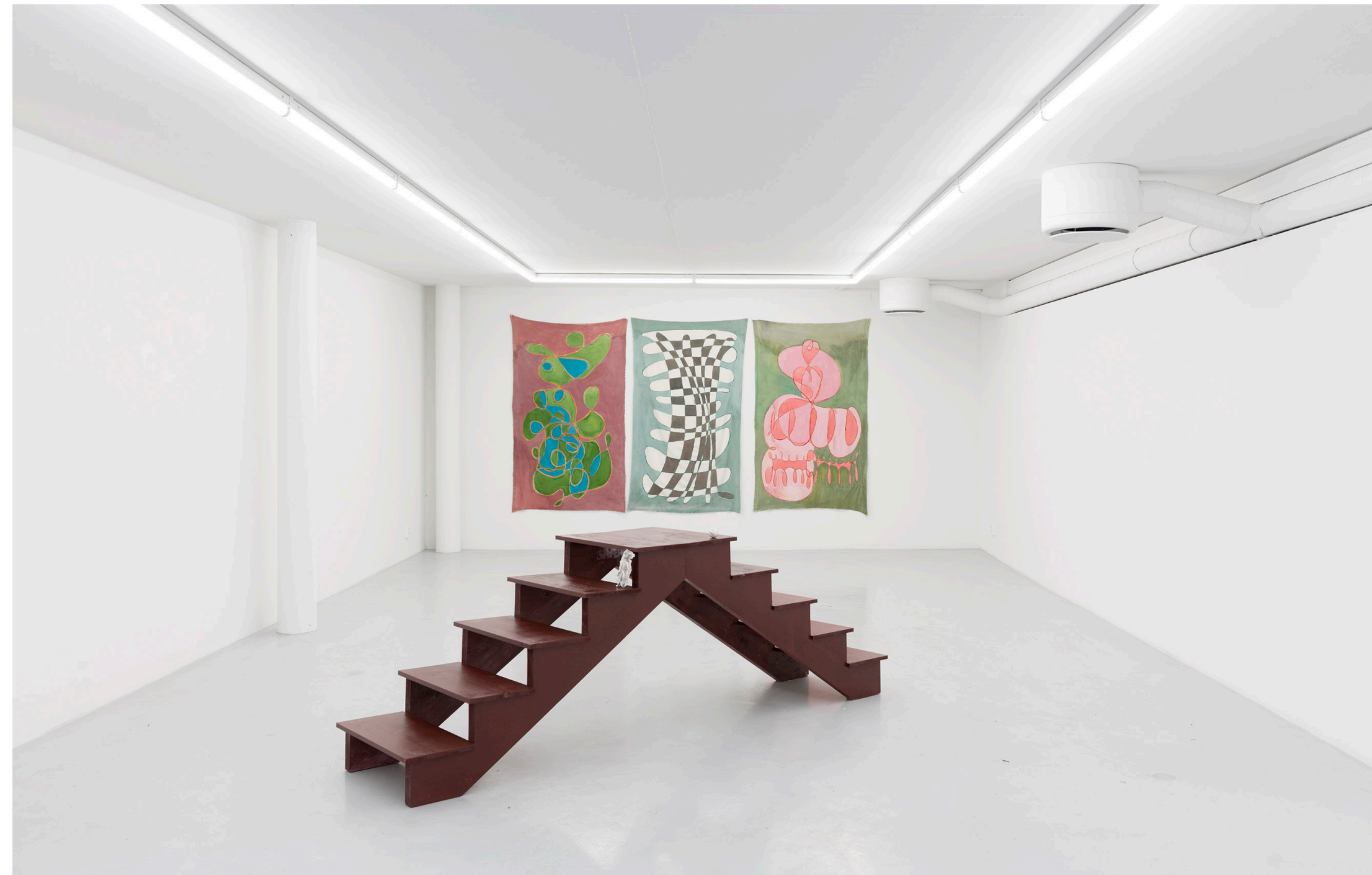
Fool, Poet, Thief, Installation view Buer Gallery, Oslo