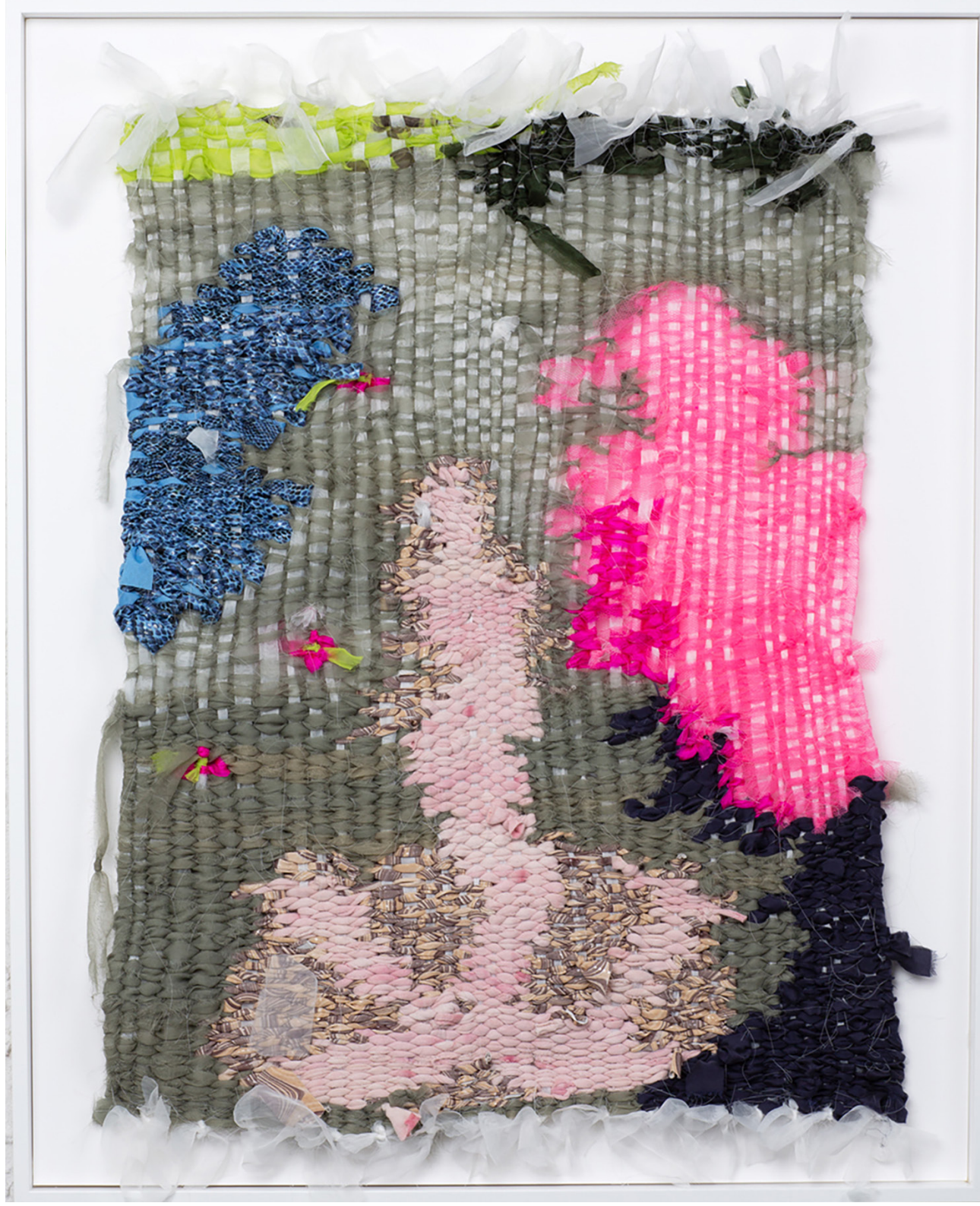
Gemma after The Birth of Venus , 2020 material from my sisters shirt and recycled textile 77 x 63 cm