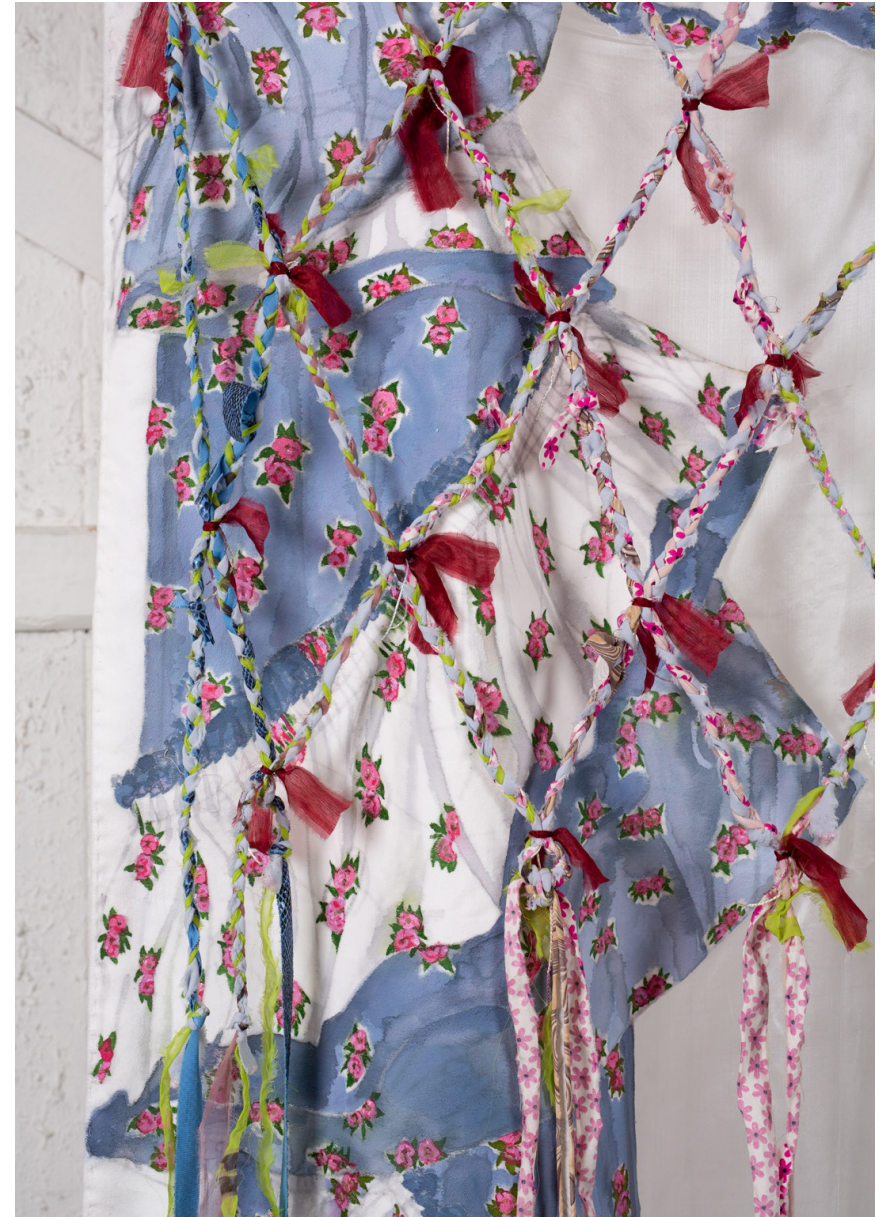
Gagoo Curtain , 2020 Liquid acrylic and reactive dye on cotton velvet, crepe de chine and recycled textile