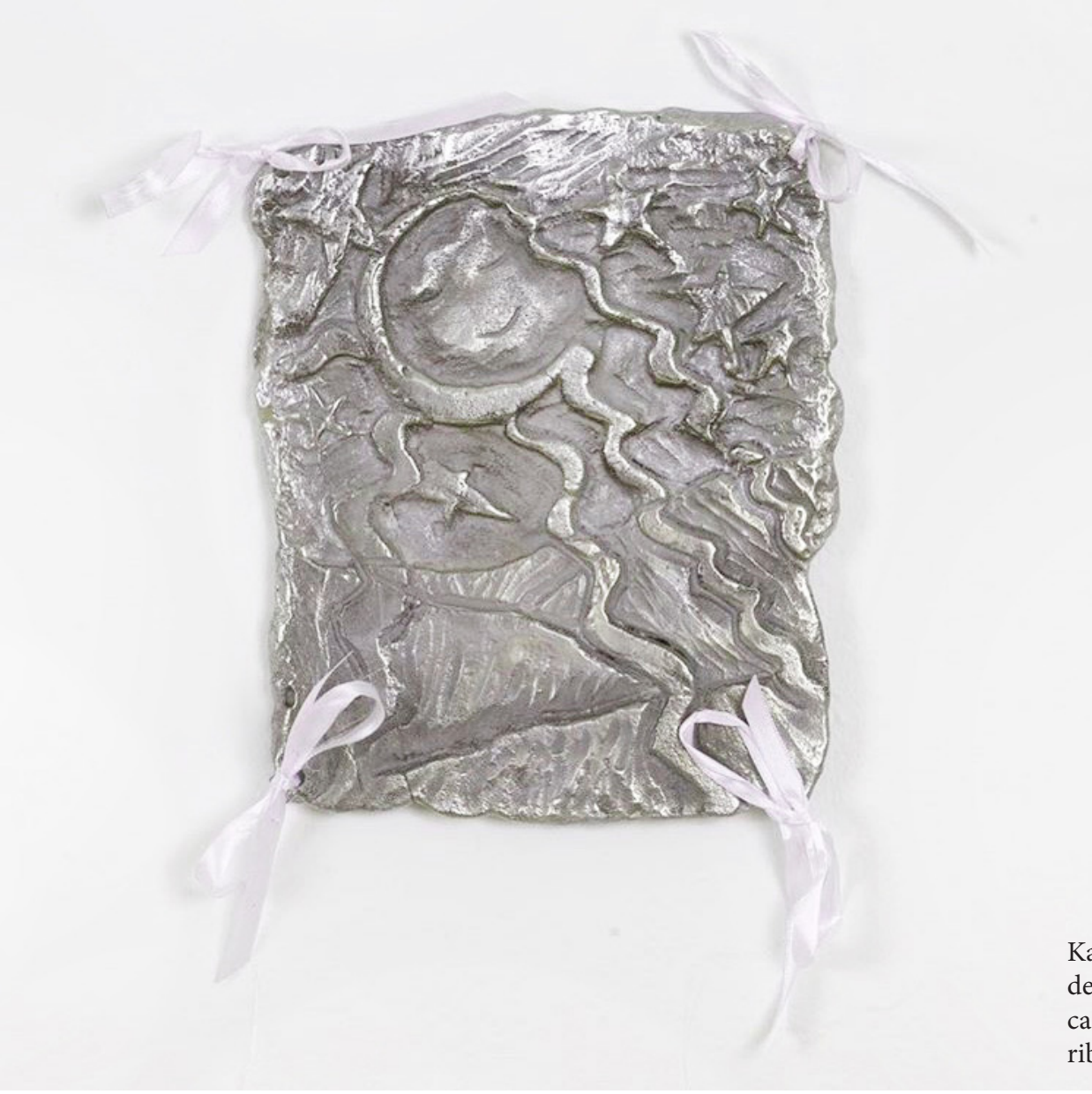
Kansas Moon Staircase, detail and instalation view. cast alluminum with nylon ribbons on steel, 2018