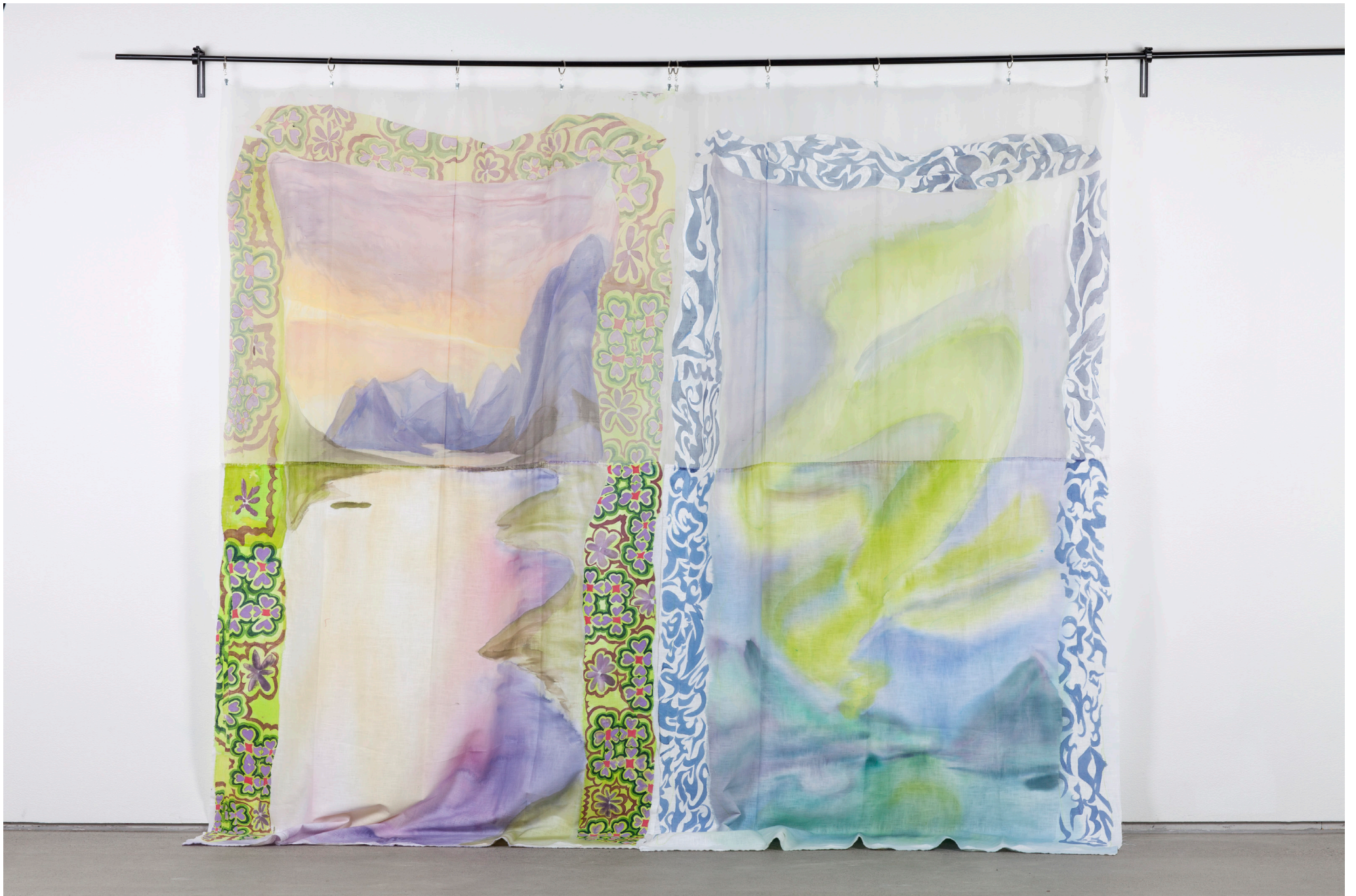
Curtains for Jim, 2019 reactive dye on silk and linnen 200 x 220 cm