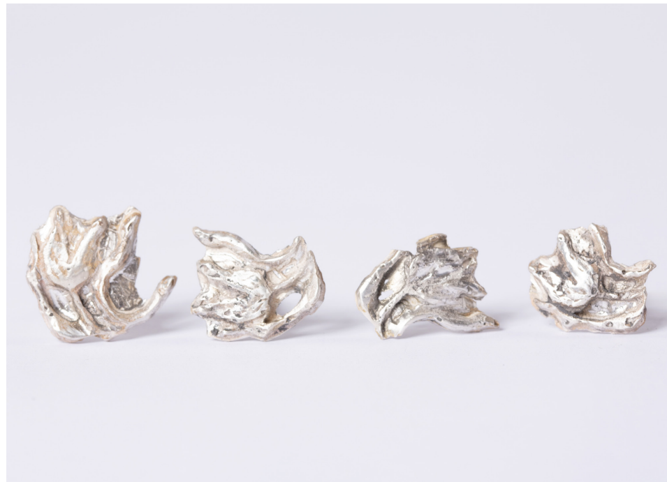
Silk weavings with details of silver wall fasteners hand cast silver and silk with nylon bows, 2020 16 x 24 cm each