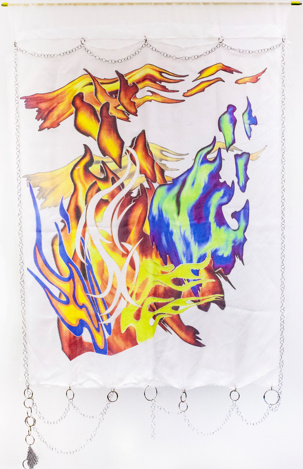
Fire bride, 2016 Digital print on silk, hand made chain 80 x 120 cm