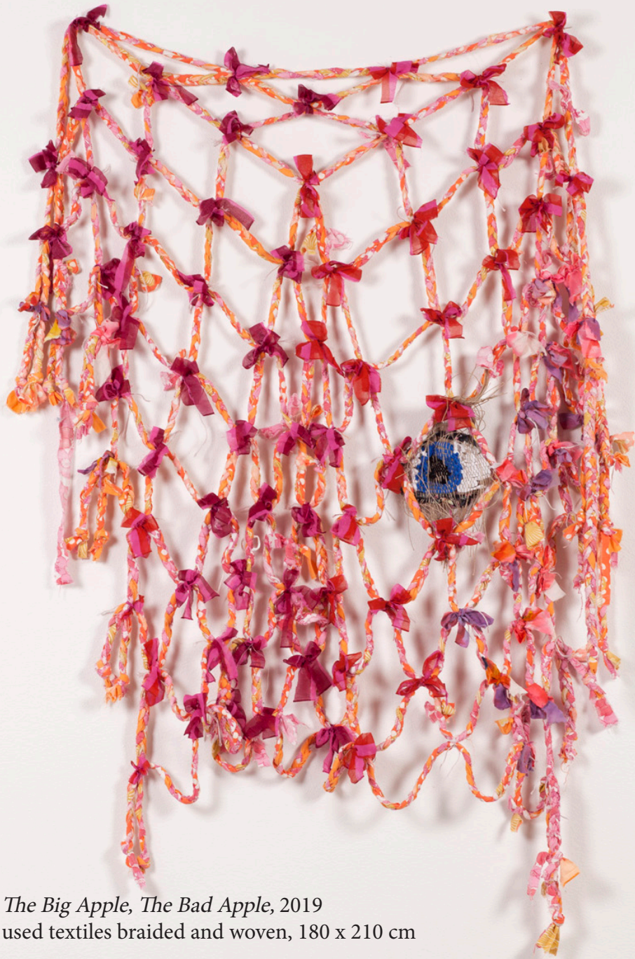
The Big Apple, The Bad Apple, 2019 used textiles braided and woven, 180 x 210 cm