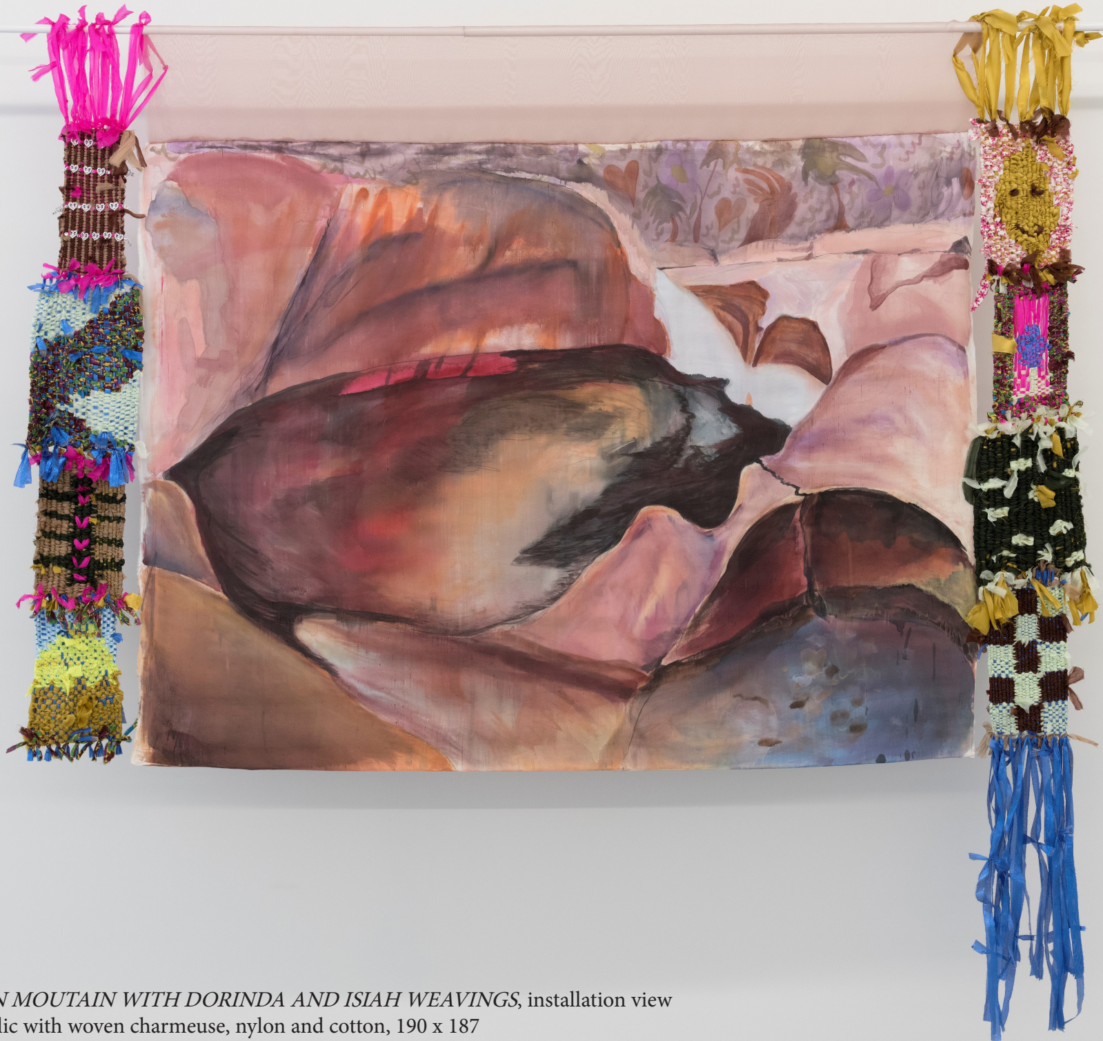
BASIN AT CANNON MOUNTAIN WITH DORINDA AND ISIAH WEAVINGS , installation view reactive dye and acrylic with woven charmeuse, nylon and cotton, 190 x 187