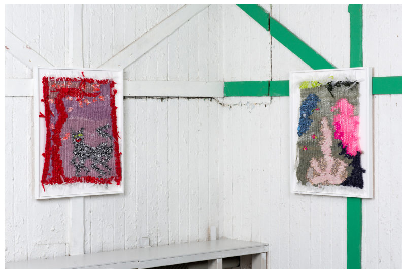
Installation view, 2020 Salgshallen, Oslo