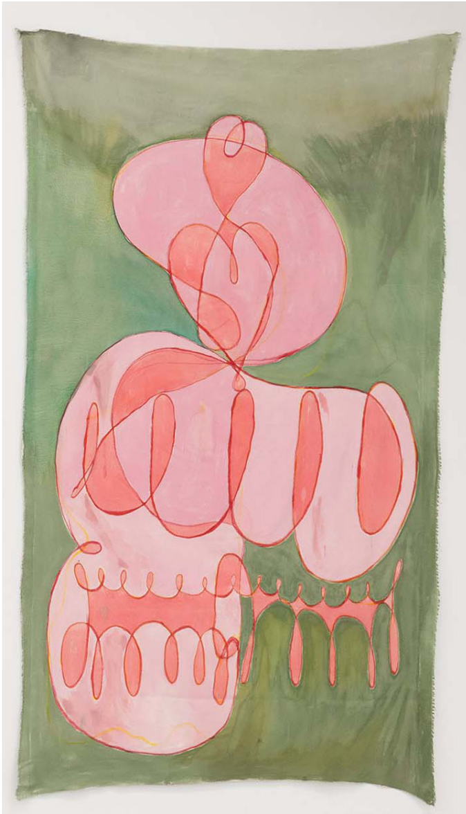
Pirouette, Zanni, Ennamor reactive dye on raw silk 100 x 200 cm each