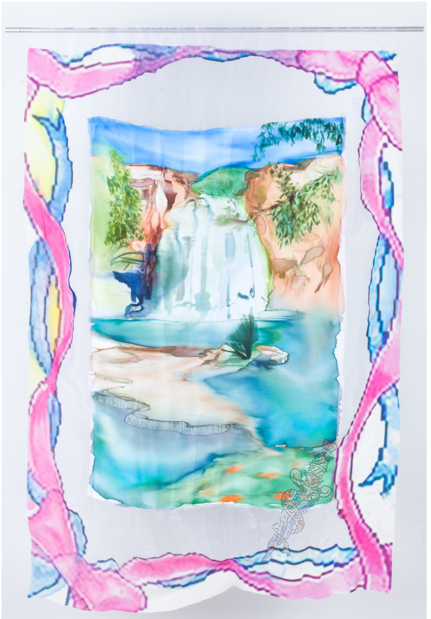
Havasus Falls, 2017 reactive dye on silk with digitally printed border and applique 70 x 90 cm