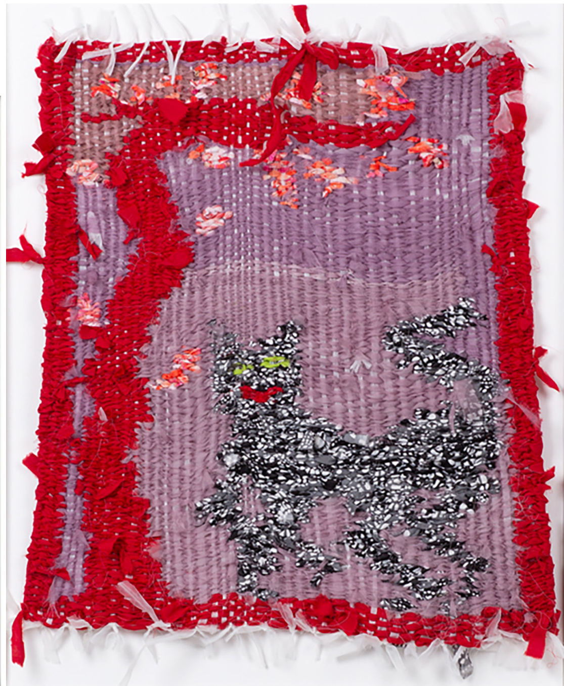
Mom after Etruscan She Wold, 2020 material from my brother's shirt and recycled textile 77 x 63 cm