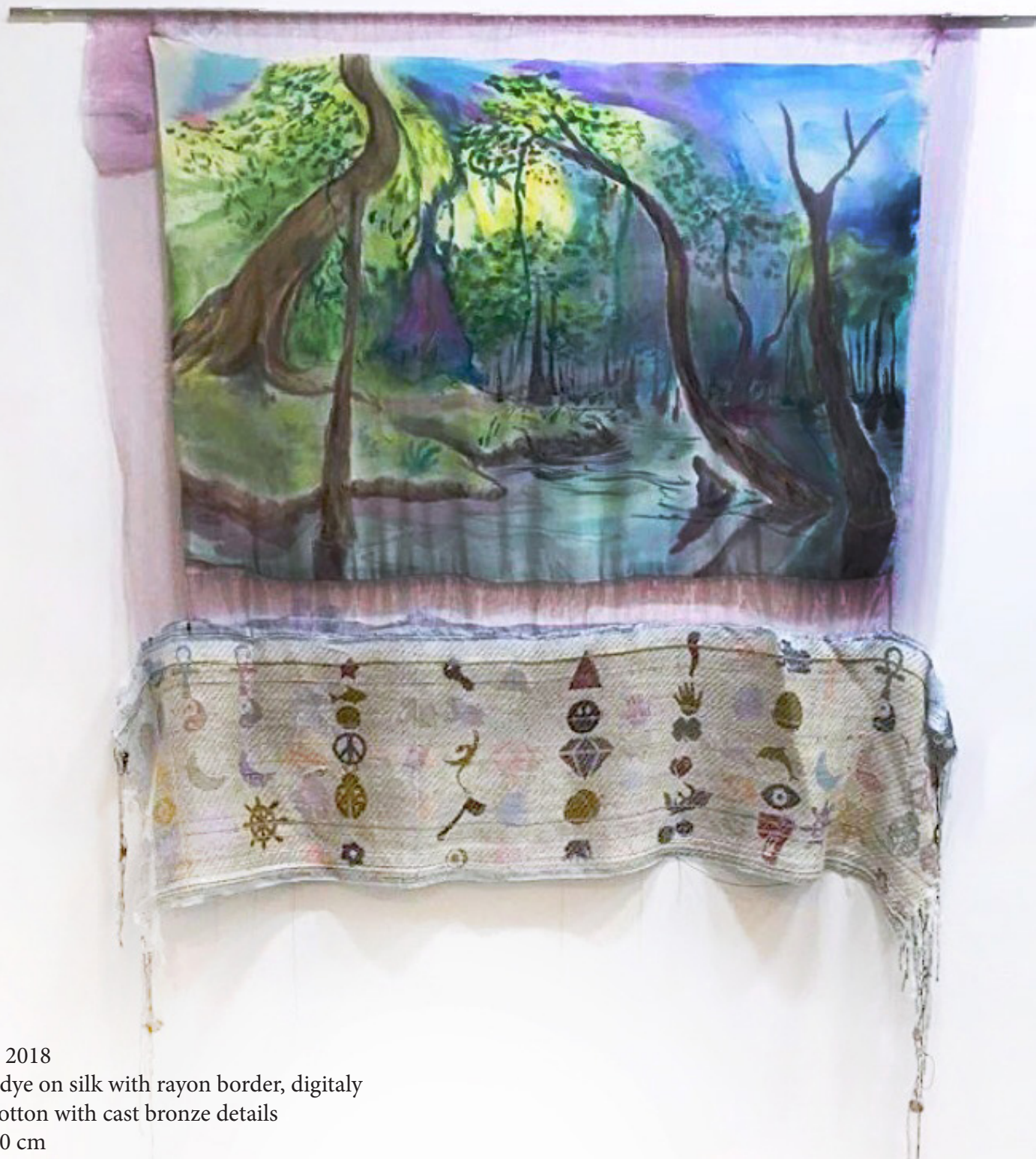
Safeway, 2018 reactive dye on silk with rayon border, digitaly woven cotton with cast bronze details 160 x 160 cm