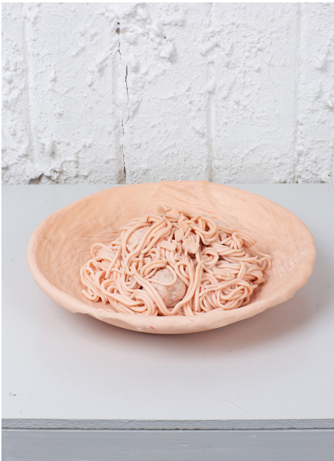
Spaghetti and Meatballs, 2020 polymer clay