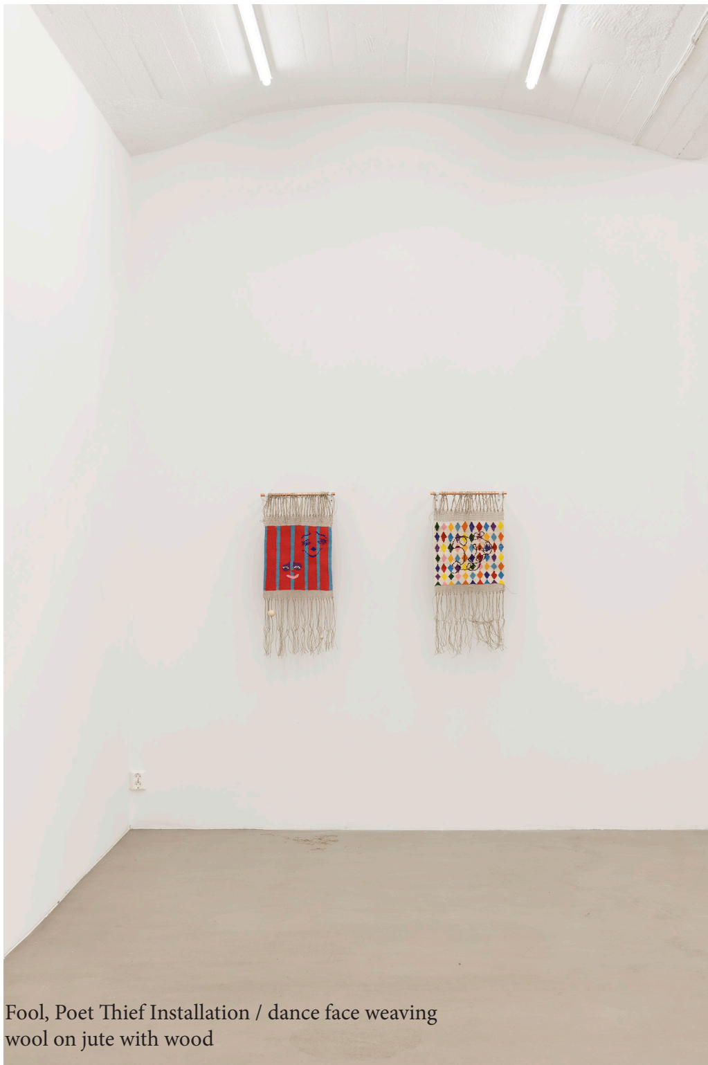
Fool, Poet Thief Installation / dance face weaving wool on jute with wood