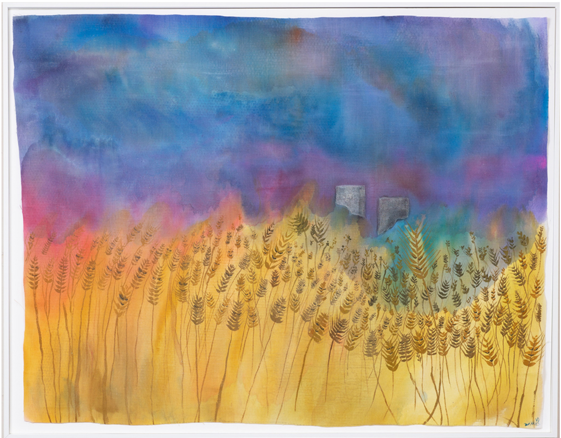
Wheat Field in Lower Manhattan After Agnes Denes, 2020 reactive dye on linen, 88 x 115